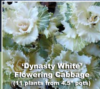
'Dynasty White' Flowering Cabbage (11 plants from 4.5" pots)