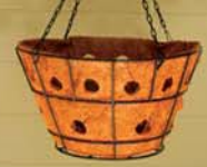
20" double basic basket

I didn't expect to like this arrangement when I planted it, but I couldn't resist trying these glamorous cabbages in the side of a basket. I thought they would get too big and hide the pansies planted along the top edge.