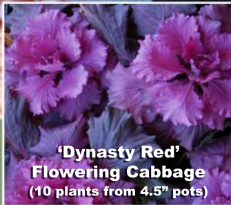
'Dynasty Red' Flowering Cabbage (10 plants from 4.5" pots)