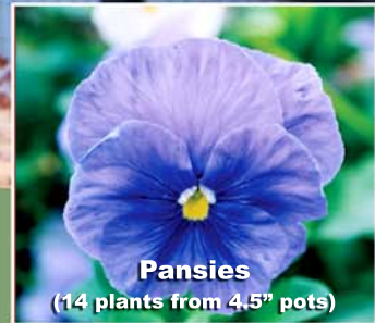
Pansies (14 plants from 4.5" pots)